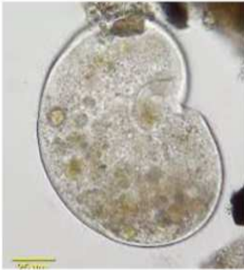
Figure 6: Colpoda oval Cell

provide various genetically distinct offspring.