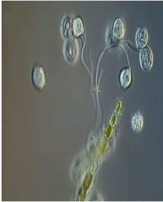
Figure 8: Shows Zoothamnium