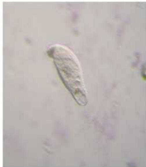
Figure 5: Live Cell of Metopus