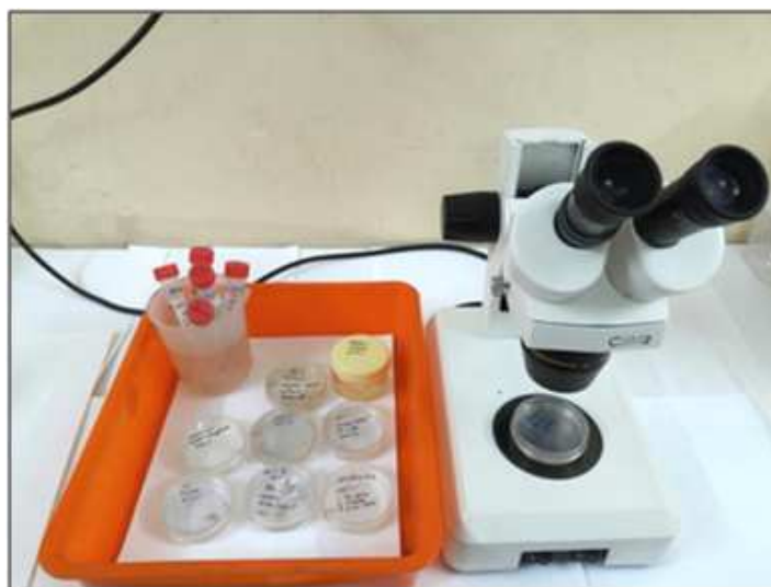
Figure 3: Ciliates Cells of Monocultures and Stereoscopic Microscope

Morphological study was done for ciliate cells from monoclonal culture were harvested from the culture medium and observed with an AxioCam ERC 5s microscope equipped with a digital camera, Carl Zeiss. Length measures, on both living and fixed cells, were taken on collected pictures with the software magnification.