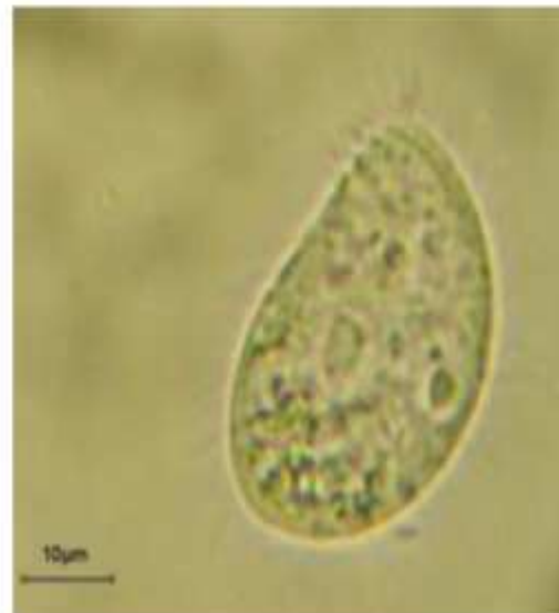
Figure 7: Trophozoite of Colpoda spp

Figure I) Colpoda is an oval cell with an obvious small cytostome about midway down the cell. The cytostome has rows of small membranelles.