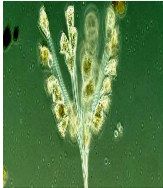
Figure 9: Shows Zoothamnium Colony