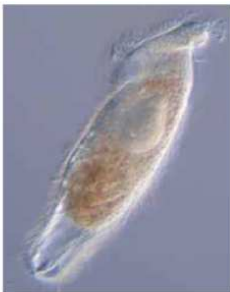
Figure 4: Metopus

Metopus is a genus of anaerobic organisms from the family of Metopidae [10]. Body elongate, ovoid; anterior left kineties curved (Fig.4). Right paroralkineties formed of several kineties [5,18]. Distinct frontal lobe overhangs the oral area. Members of this genus of metopid ciliates are 50 to 300 microns long. The cell is not flattened but is asymmetrical as the anterior region is twisted to the left (Fig. 5). The oral aperture is located equatorially or sub equatorially [18]. An adoral zone of membranelles arises from the oral aperture and runs obliquely towards the left anterior end of the cell, following under the twisted anterior end. The cell is covered with somatic kineties; those on the ventral surface extend from the posterior to the adoral zone of membranelles; those on the dorsal surface extend to the anterior end and over the top of the spiraled anterior end [5, 18]. There is a series of closely aligned kineties, to the right and above the adoral zone of membranelles, that produce an anterior mane of cilia [16]. A single ovoid macronucleus is typically situated in the middle of the cell. A single large contractile vacuole occurs in the posterior of the cell. Some species may be colored or have prominent bacterial symbionts. Common, found in benthic, freshwater, marine; soil, anoxic and saprobic sites. Metopus species are anaerobes and Nyctotherus is a common symbiont in the gut of amphibians [10-11, 23]