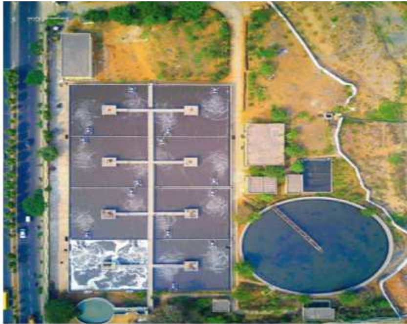
Figure 2: Site Layout Map Image of Sampling Station, Appughar STP (Sewage Treatment Plant)